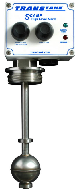
The Indicator is shown here attached to the magnetic level switch